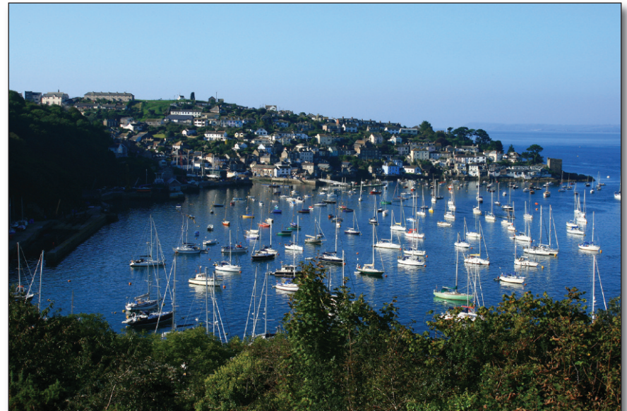
Looking over towards Polruan