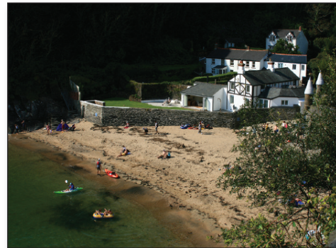
Above: Readymoney Cove