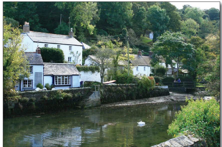
The creek at Helford